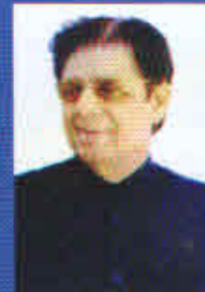
Mr. E Ahmad Union Minister of State for External Affairs (Government of India)

REACH YOUR TARGET! THE BIGGEST BUYER SOURCING PLATFORM YOUR BIGGEST PARTNER FOR MARKET EXPANSION, LEAD GENERATION IN INDIA'S MOBILE HANDSET INDUSTRY