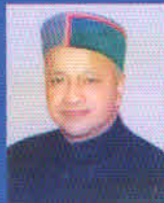
Mr. Virbhadra Singh Union Minister of Micro, Small & Medium Enterprises (Government of India)